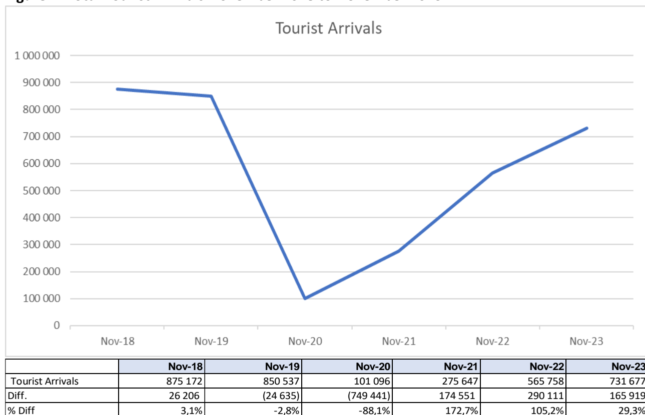
Figure 1: Total Tourist Arrivals November 2018 to November 2023